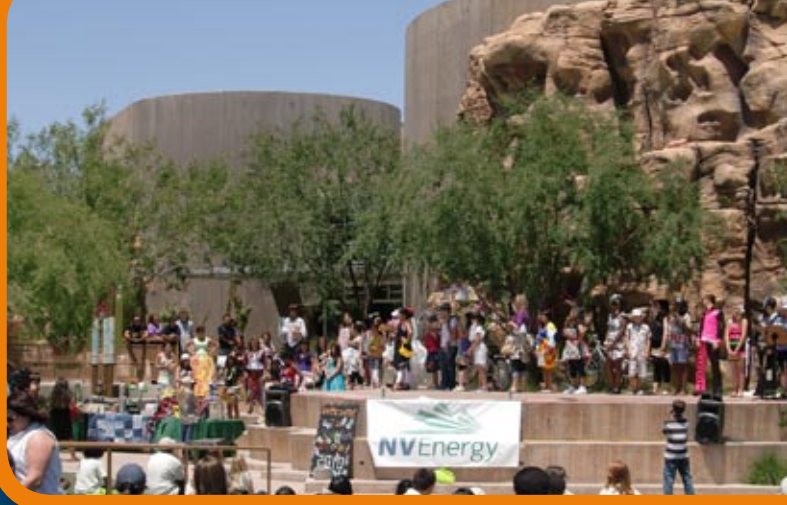
2010 FASHION-TRASHION Show