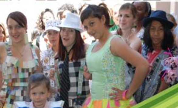
Tarkanian Middle School Students