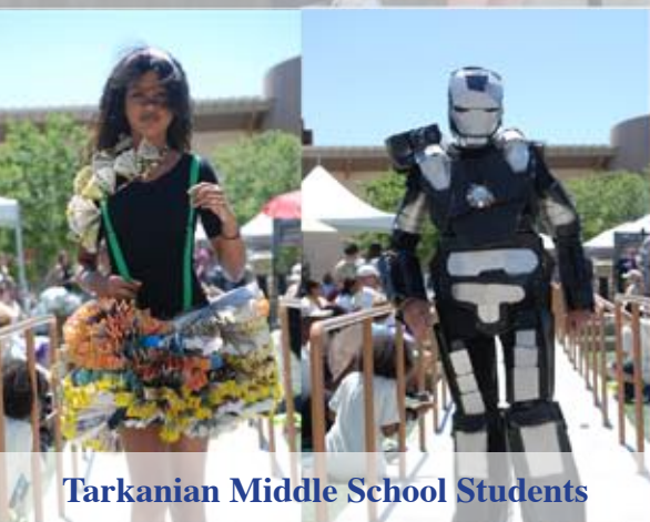
Tarkanian Middle School Students