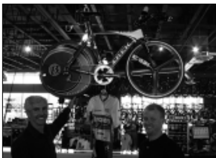
Trek Bicycles of Ventura, not only sells the bikes that famed bicyclist Lance Armstrong and his teammates race on, but also has bikes for recreational, commuter, and family needs.

For more information or to make arrangements for home care, please contact Help Unlimited at 654-6990.