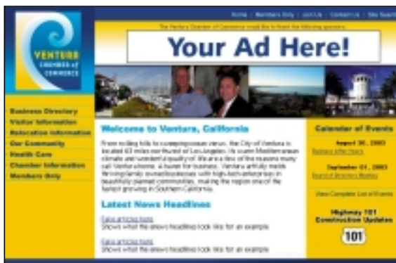
Chamber WebLink's database technology creates a highly interactive experience for members and promotes businesses in our region.

The Ventura Chamber of Commerce is launching a new interactive Web site and advertising program. The Chamber's new virtual headquarters advancements have been made in Web Technology by Chamber WebLink, the nation's largest provider of chamber Web sites and interactive online products. Chamber WebLink's database technology creates a highly interactive experience for members and promotes outstanding